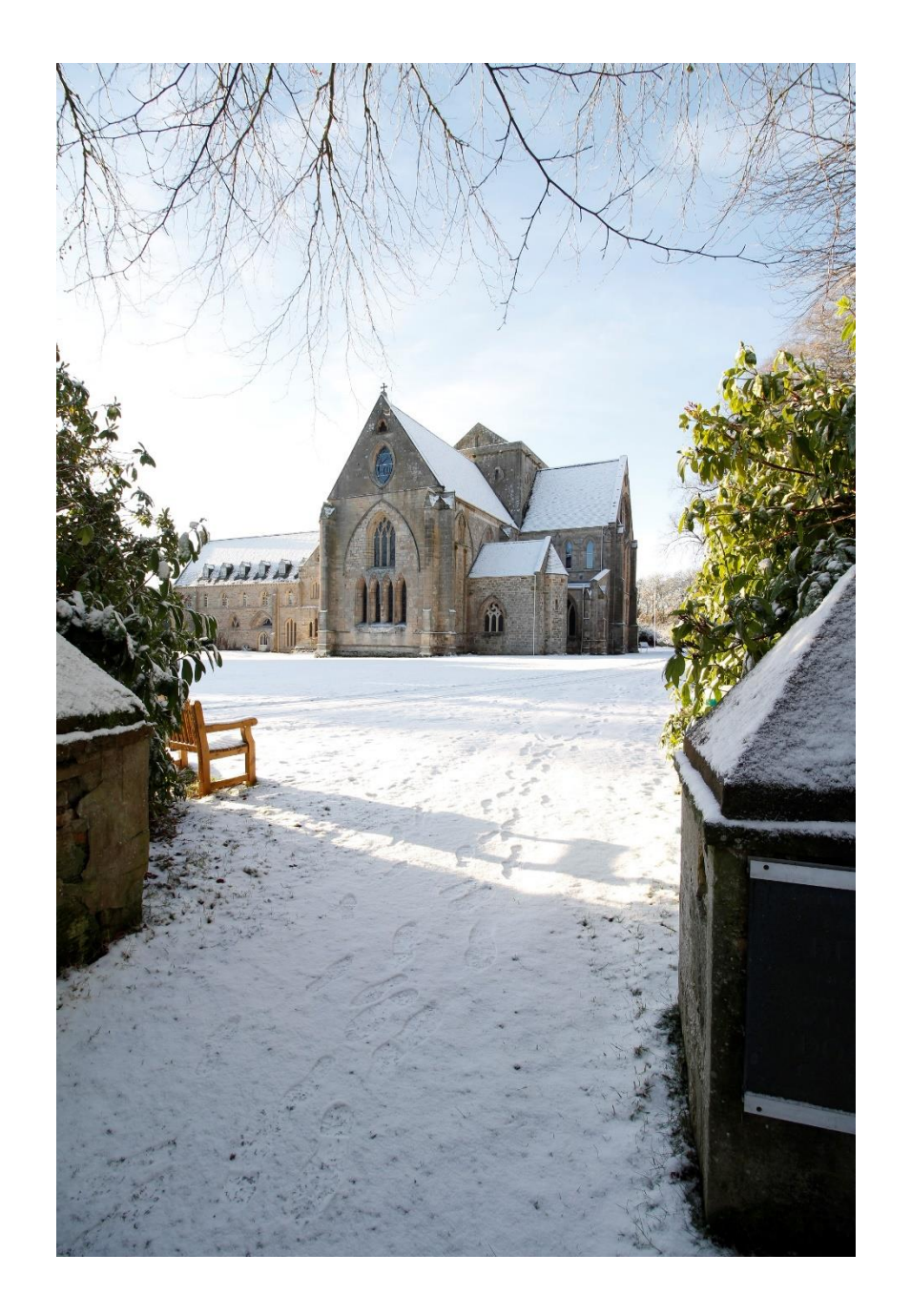
Abbey in January 2021