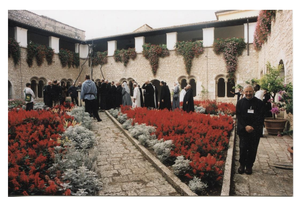
Casamari Cloister: Meeting of Subiaco Superiors in 2000