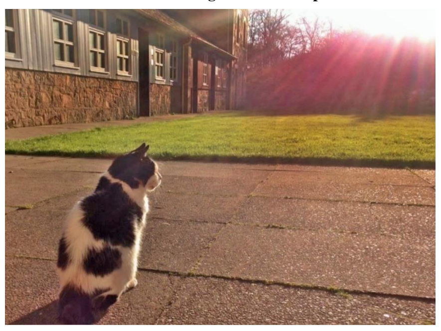
Baxter looking towards the westering sun.